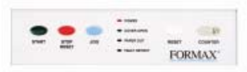
User Friendly Control Panel

U.S. Patents 5,772,841, 5,865,925, 5,968,308 & 6,264,592 Other Patents Pending