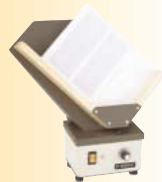
The FD 400 Jogger is a recommended option that reduces static electricity from forms and aligns them for proper feeding.